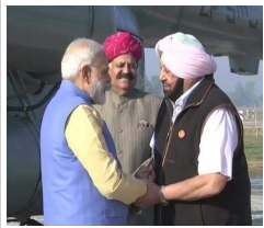
DURING A SPECIAL FUNCTION ORGANIZED BY INDIAN DIASPORA TO MARK 550TH BIRTH ANNIVERSARY