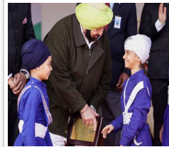
Punjab Chief Minister Captain Amarinder Singh Presenting A Memento To The Budding Gatka Players On 71st Republic Day Function At SAS Nagar (Mohali) On Sunday.