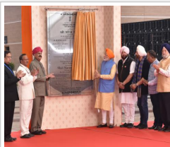
Prime Minister Narendra Modi Along With Punjab Governor VP Singh Badnore And Chief Minister Captain Amarinder Singh Inaugurating The Integrated Check Post At Dera Baba Nanak To Mark The Opening Of Kartarpur Corridor On Saturday.