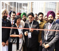
PPIS 2019 KICKS OFF WITH EXHIBITION SHOWCASING PRODUCTS OF TOP INDUSTRIES, MSMEs & STARTUPS