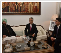
JAPANESE AMBASSADOR MEETS CAPT. AMARINDER, DISCUSSES INVESTMENT OPPORTUNITIES IN PUNJAB