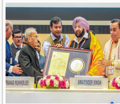
CAPT AMARINDER CONFERRED WITH 10th BCS 'IDEAL CHIEF MINISTER' AWARD FOR UNIQUE INITIATIVES TO BOOST STATE'S HOLISTIC GROWTH