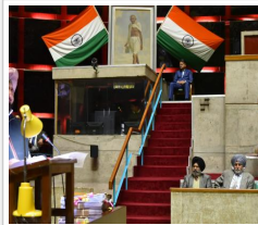
Punjab Chief Minister Captain Amarinder Singh During Fourth Day Of Budget Session Of Punjab Vidhan Sabha On Wednesday.