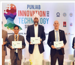
ਪੰਜਾਬ ਦੇ ਵਿੱਤ ਮੰਤਰੀ ਮਨਪ੍ਰੀਤ ਸਿੰਘ ਬਾਦਲ ਲਲਿਤ ਹੋਟਲ ਚੰਡੀਗੜ੍ਹ ਵਿਖੇ 'ਪੰਜਾਬ ਇਨੋਵੇਸ਼ਨ ਅਤੇ ਤਕਨਾਲੋਜੀ ਸਮਿੱਟ 2019' ਦੌਰਾਨ