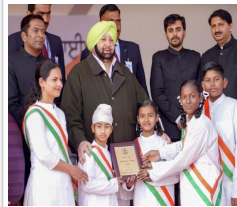
Punjab Chief Minister Captain Amarinder Singh Presenting A Memento To A Group Of Specially-Abled Children Which Performed National Anthem During 71st Republic Day Function At SAS Nagar (Mohali) On Sunday.