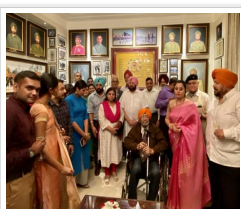
A ROOM SEEPED IN VALOUR - CAPT AMARINDER'S ODE TO 2 SIKHS