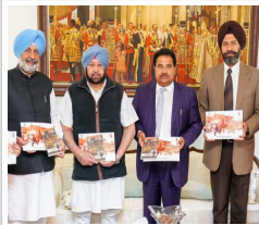
Punjab Chief Minister Captain Amarinder Singh Released A Booklet 'Because We Haven't Forgotten...' Along With A CD Of Documentary Film 'Jallianwala Bagh Punjab Da Dil' In Punjabi And Hindi Dedicated To Jallianwala Bagh Centenary Commemoration