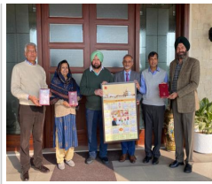
Punjab Chief Minister Captain Amarinder Singh On Saturday Released The Punjab Government's Diary And Calendar For The Year 2020. The New Year Calendar Is Dedicated To The Khulle Darshan-Didar Of Sri Darbar Sahib In Kartarpur, Pakistan.