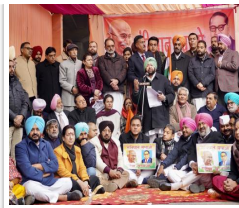
AT PUNJAB CONGRESS PROTEST DHARNA, CM DECLARES `WE WILL NOT TOLERATE ANY ATTEMPT TO TINKER WITH CONSTITUTION'S PREAMBLE'