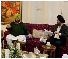
CAPT AMARINDER MEETS NHAI CHAIRMAN, BOTH AGREE ON EXPEDITIOUS COMMENCEMENT OF WORK ON DELHI-AMRITSAR-KATRA EXPRESSWAY PROJECT