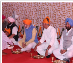
PM ALONG WITH CAPTAIN AMARINDER PARTAKES LANGAR IN PUNJAB GOVERNMENT PANDAL