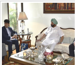
CAPT AMARINDER MOOTS A PUNJAB IRAN CHAMBER OF COMMERCE TO BOOST TRADE, INVITES IRANIAN ENVOY TO 550TH PRAKASH PURB