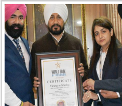
VIRASAT-E-KHALSA BAGS ANOTHER AWARD, GETS LISTED IN 'WORLD BOOK OF RECORDS'