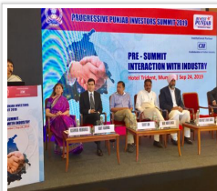
DELEGATION OF PUNJAB GOVERNMENT HOLDS PRE-SUMMIT INTERACTION WITH INDUSTRY