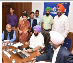
PUNJAB GOES TOTALLY HI-TECH AS CAPT AMARINDER LAUNCHES OFFICE FOR ELECTRONIC FILE MOVEMENT