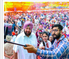
Ghar Ghar Rozgar & Karobar Mission' Scheme, Punjab Chief Minister On Saturday Declared All-Out Efforts To Identify The Poorest Of The Poor Jobless In Villages For Employment, Even As He Announced A Free Coaching Scheme For Candidates To Prepare For Group