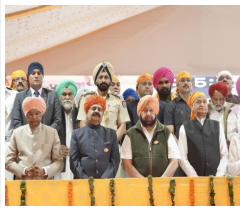
The President Of India Ram Nath Kovind, Governor Punjab VP Singh Badnore And Punjab Chief Minister Captain Amarinder Singh, Rajasthan Chief Minister Ashok Gehlot, Patiala Member Parliament Preet Kaur, Cultural Affairs Minister Charanjit Singh Channi