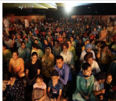
MORE THAN 8800 VISITORS VISIT LIGHT & SOUND SHOW ALONG WITH DIGITAL MUSEUM IN LUDHIANA