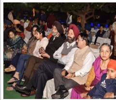
STUPENDOUS FLOATING MULTIMEDIA LIGHT AND SOUND SHOW DRAWS UNPRECEDENTED RUSH OF PEOPLE