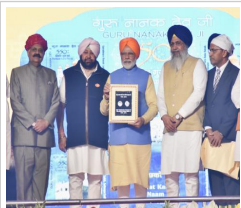
CAPT AMARINDER SINGH HOPES CORRIDOR WOULD LEAD TO PEACEFUL ENVIRONMENT BETWEEN BOTH COUNTRIES LEADING TO EASY ACCESS TO OTHER GURDWARAS