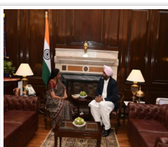
MANPREET BADAL SEEKS EARLY RELEASE OF GST ARREARS FROM NIRMALA SITHARAMAN