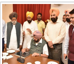
CAPT AMARINDER LAUNCHES 1ST OF ITS KIND 'PUNJAB JOB HELPLINE' FOR UNEMPLOYED YOUTH