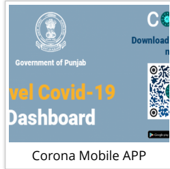
Corona Mobile APP