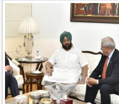
PUNJAB CM SEEKS INVESTMENT FROM US COMPANIES IN MEETING WITH NEW JERSEY SENATOR