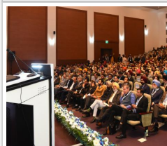
PUNJAB GOVT COMMITTED TO TRANSFORMING MSMEs INTO INDUSTRIAL GIANTS: VINI MAHAJAN