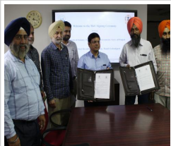
PUNJAB INKS MoU WITH INDUSTRIAL ASSOCIATIONS & GNDEC-LUDHIANA TO PROMOTE RESEARCH & INNOVATION