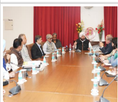
CAPT AMARINDER SEEKS WB SUPPORT TO HELP PUNJAB'S FARMERS SHIFT TO ALTERNATE CROPS TO