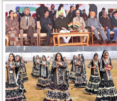
Punjab Chief Minister Captain Amarinder Singh Along With Dignitaries Witnessing The Cultural Programme On 71st Republic Day Function At SAS Nagar (Mohali) On Sunday.