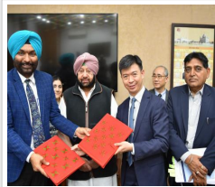
PUNJAB INKS MoU WITH SINGAPORE'S CIG TO EXPLORE LEADERSHIP TRAINING, SHOWCASE STATE AS INVESTMENT DESTINATION