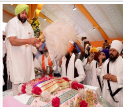
CAPT AMARINDER USHERS IN WEEK-LONG 550TH PRAKASH PURB CELEBRATIONS AT SULTANPUR LODHI WITH GURU GRANTH SAHIB SAROOP SEWA