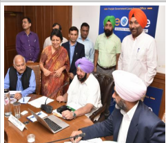
PUNJAB GOES TOTALLY HI-TECH AS CAPT AMARINDER LAUNCHES EOFFICE FOR ELECTRONIC FILE MOVEMENT