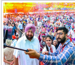
Ghar Ghar Rozgar & Karobar Mission' Scheme, Punjab Chief Minister On Saturday Declared All-Out Efforts To Identify The Poorest Of The Poor Jobless In Villages For Employment, Even As He Announced A Free Coaching Scheme For Candidates To Prepare For Group