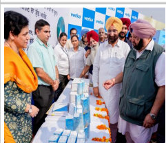
CAPTAIN AMARINDER SINGH LAUNCHES VERKA'S PIVO NATURAL VANILLA MILK & CHEALTD MINERAL MIXTURE