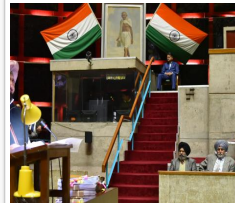
Punjab Chief Minister Captain Amarinder Singh During Fourth Day Of Budget Session Of Punjab Vidhan Sabha On Wednesday.