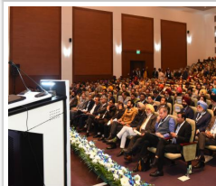
PUNJAB GOVT COMMITTED TO TRANSFORMING MSMEs INTO INDUSTRIAL GIANTS: VINI MAHAJAN