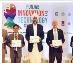
ਪੰਜਾਬ ਦੇ ਵਿੱਤ ਮੰਤਰੀ ਮਨਪ੍ਰੀਤ ਸਿੰਘ ਬਾਦਲ ਲਾਲਿਤ ਹੋਟਲ ਚੰਡੀਗੜ੍ਹ ਵਿਖੇ 'ਪੰਜਾਬ ਇਨੋਵੇਸ਼ਨ ਅਤੇ ਤਕਨਾਲੋਜੀ ਸਮਿੱਟ 2019' ਦੌਰਾਨ