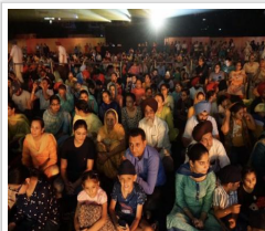
MORE THAN 8800 VISITORS VISIT LIGHT & SOUND SHOW ALONG WITH DIGITAL MUSEUM IN LUDHIANA