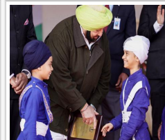
Punjab Chief Minister Captain Amarinder Singh Presenting A Memento To The Budding Gatka Players On 71st Republic Day Function At SAS Nagar (Mohali) On Sunday.