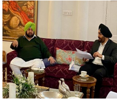
CAPT AMARINDER MEETS NHAI CHAIRMAN, BOTH AGREE ON EXPEDITIOUS COMMENCEMENT OF WORK ON DELHI-AMRITSAR-KATRA EXPRESSWAY PROJECT