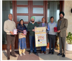
Punjab Chief Minister Captain Amarinder Singh On Saturday Released The Punjab Government's Diary And Calendar For The Year 2020. The New Year Calendar Is Dedicated To The Khulle Darshan-Didar Of Sri Darbar Sahib In Kartarpur, Pakistan.