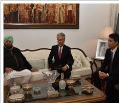
JAPANESE AMBASSADOR MEETS CAPT. AMARINDER, DISCUSSES INVESTMENT OPPORTUNITIES IN PUNJAB