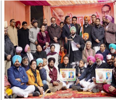
AT PUNJAB CONGRESS PROTEST DHARNA, CM DECLARES `WE WILL NOT TOLERATE ANY ATTEMPT TO TINKER WITH CONSTITUTION'S PREAMBLE'