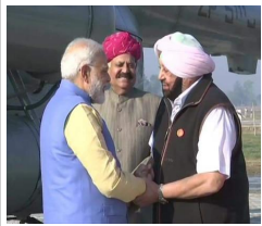
Prime Minister Mr. Narendra Modi Being Received By Punjab Governor Mr. VP Singh Badnore And Chief Minister Captain Amarinder Singh At Bussawal Village In Sultanpur Lodhi On Saturday.