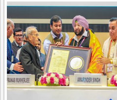
CAPT AMARINDER CONFERRED WITH 10th BCS 'IDEAL CHIEF MINISTER' AWARD FOR UNIQUE INITIATIVES TO BOOST STATE'S HOLISTIC GROWTH