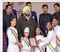
Punjab Chief Minister Captain Amarinder Singh Presenting A Memento To A Group Of Specially-Abled Children Which Performed National Anthem During 71st Republic Day Function At SAS Nagar (Mohali) On Sunday.