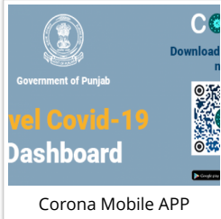
Corona Mobile APP