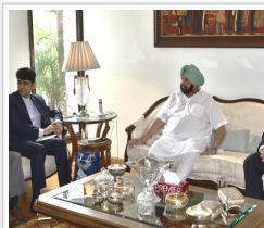
CAPT AMARINDER MOOTS A PUNJAB IRAN CHAMBER OF COMMERCE TO BOOST TRADE, INVITES IRANIAN ENVOY TO 550TH PRAKASH PURB