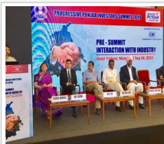
DELEGATION OF PUNJAB GOVERNMENT HOLDS PRE-SUMMIT INTERACTION WITH INDUSTRY