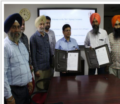
PUNJAB INKS MoU WITH INDUSTRIAL ASSOCIATIONS & GNDEC-LUDHIANA TO PROMOTE RESEARCH & INNOVATION