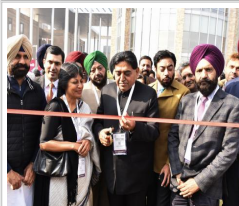
PPIS 2019 KICKS OFF WITH EXHIBITION SHOWCASING PRODUCTS OF TOP INDUSTRIES, MSMEs & STARTUPS