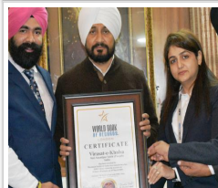
VIRASAT-E-KHALSA BAGS ANOTHER AWARD, GETS LISTED IN 'WORLD BOOK OF RECORDS'