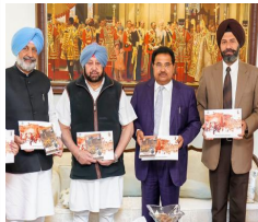
Punjab Chief Minister Captain Amarinder Singh Released A Booklet 'Because We Haven't Forgotten...' Along With A CD Of Documentary Film 'Jallianwala Bagh Punjab Da Dil' In Punjabi And Hindi Dedicated To Jallianwala Bagh Centenary Commemoration