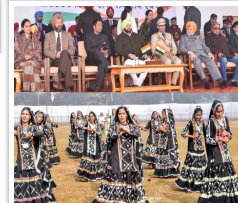
Punjab Chief Minister Captain Amarinder Singh Along With Dignitaries Witnessing The Cultural Programme On 71st Republic Day Function At SAS Nagar (Mohali) On Sunday.