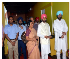
CABINET MINISTER CHARANJIT SINGH CHANNI AND BALBIR SINGH SIDHU LAUNCHED 4-MONTH ELABORATE PROGRAMME TO COMMEMORATE GURU SAHIB'S MEMORY