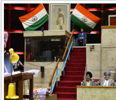
Punjab Chief Minister Captain Amarinder Singh During Fourth Day Of Budget Session Of Punjab Vidhan Sabha On Wednesday.