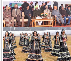
Punjab Chief Minister Captain Amarinder Singh Along With Dignitaries Witnessing The Cultural Programme On 71st Republic Day Function At SAS Nagar (Mohali) On Sunday.