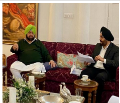
CAPT AMARINDER MEETS NHAI CHAIRMAN, BOTH AGREE ON EXPEDITIOUS COMMENCEMENT OF WORK ON DELHI-AMRITSAR-KATRA EXPRESSWAY PROJECT