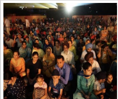
MORE THAN 8800 VISITORS VISIT LIGHT & SOUND SHOW ALONG WITH DIGITAL MUSEUM IN LUDHIANA