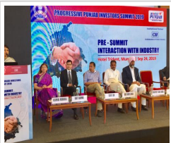
DELEGATION OF PUNJAB GOVERNMENT HOLDS PRE-SUMMIT