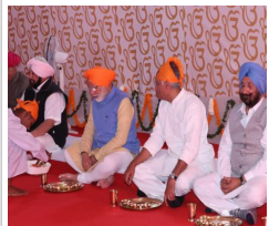
PM ALONG WITH CAPTAIN AMARINDER PARTAKES LANGAR IN PUNJAB GOVERNMENT PANDAL