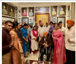
A ROOM SEEPED IN VALOUR - CAPT AMARINDER'S ODE TO 2 SIKHS