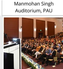
PUNJAB GOVT COMMITTED TO TRANSFORMING MSMES INTO INDUSTRIAL GIANTS: VINI MAHAJAN