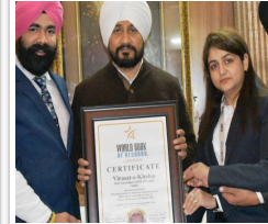
VIRASAT-E-KHALSA BAGS ANOTHER AWARD, GETS LISTED IN 'WORLD BOOK OF RECORDS'