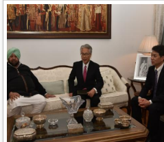
JAPANESE AMBASSADOR MEETS CAPT. AMARINDER, DISCUSSES INVESTMENT OPPORTUNITIES IN PUNJAB