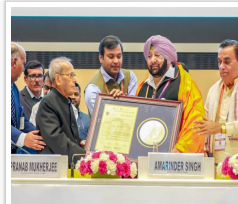
CAPT AMARINDER CONFERRED WITH 10th BCS 'IDEAL CHIEF MINISTER' AWARD FOR UNIQUE INITIATIVES TO BOOST STATE'S HOLISTIC GROWTH