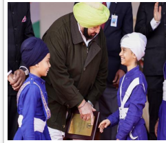
Punjab Chief Minister Captain Amarinder Singh Presenting A Memento To The Budding Gatka Players On 71st Republic Day Function At SAS Nagar (Mohali) On Sunday.