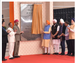
Prime Minister Narendra Modi Along With Punjab Governor VP Singh Badnore And Chief Minister Captain Amarinder Singh Inaugurating The Integrated Check Post At Dera Baba Nanak To Mark The Opening Of Kartarpur Corridor On Saturday.