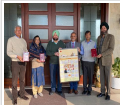
Punjab Chief Minister Captain Amarinder Singh On Saturday Released The Punjab Government's Diary And Calendar For The Year 2020. The New Year Calendar Is Dedicated To The Khulle Darshan-Didar Of Sri Darbar Sahib In Kartarpur, Pakistan.