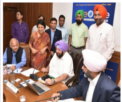
PUNJAB GOES TOTALLY HI-TECH AS CAPT AMARINDER LAUNCHES EOFFICE FOR ELECTRONIC FILE MOVEMENT