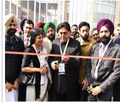
PPIS 2019 KICKS OFF WITH EXHIBITION SHOWCASING PRODUCTS OF TOP INDUSTRIES, MSMES & STARTUPS