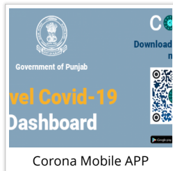
Corona Mobile APP