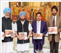
Punjab Chief Minister Captain Amarinder Singh Released A Booklet 'Because We Haven't Forgotten...' Along With A CD Of Documentary Film 'Jallianwala Bagh Punjab Da Dil' In Punjabi And Hindi Dedicated To Jallianwala Bagh Centenary Commemoration