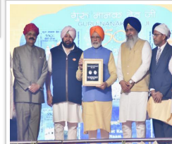
CAPT AMARINDER SINGH HOPES CORRIDOR WOULD