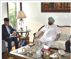
CAPT AMARINDER MOOTS A PUNJAB IRAN CHAMBER OF COMMERCE TO BOOST TRADE, INVITES IRANIAN