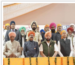
The President Of India Ram Nath Kovind, Governor Punjab VP Singh Badnore And Punjab Chief Minister Captain Amarinder Singh, Rajasthan Chief Minister Ashok Gehlot, Patiala Member Parliament Preet Kaur, Cultural Affairs Minister Charanjit Singh Channi