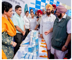
CAPTAIN AMARINDER SINGH LAUNCHES VERKA'S PIO NATURAL VANILA MILK & CHEALTED MINERAL MIXTURE