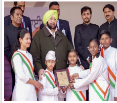
Punjab Chief Minister Captain Amarinder Singh Presenting A Memento To A Group Of Specially-Abled Children Which Performed National Anthem During 71st Republic Day Function At SAS Nagar (Mohali) On Sunday.