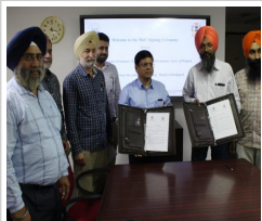
PUNJAB INKS MoU WITH INDUSTRIAL ASSOCIATIONS & GNDEC-LUDHIANA TO PROMOTE RESEARCH & INNOVATION