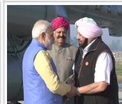
Prime Minister Mr. Narendra Modi Being Received By Punjab Governor Mr. VP Singh Badnore And Chief Minister Captain Amarinder Singh At Bussowal Village In Sultanpur Lodhi On Saturday.