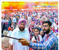
Ghar Ghar Rozgar & Karobar Mission' Scheme, Punjab Chief Minister On Saturday Declared All-Out Efforts To Identify The Poorest Of The Poor Jobless In Villages For Employment, Even As He Announced A Free Coaching Scheme For Candidates To Prepare For Group