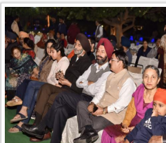
STUPENDOUS FLOATING MULTIMEDIA LIGHT AND SOUND SHOW DRAWS UNPRECEDENTED RUSH OF PEOPLE