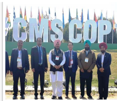
Decrease In Arrival Of Migratory Birds In Country Is A Matter Of Concern: Sadhu Singh Dharmasot