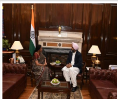
MANPREET BADAL SEEKS EARLY RELEASE OF GST ARREARS FROM NIRMALA SITHARAMAN