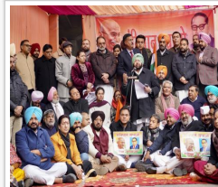
AT PUNJAB CONGRESS PROTEST DHARNA, CM DECLARES `WE WILL NOT TOLERATE ANY ATTEMPT TO TINKER WITH CONSTITUTION'S PREAMBLE'