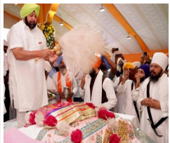
CAPT AMARINDER USHERS IN WEEK-LONG 550TH PRAKASH PURB CELEBRATIONS AT SULTANPUR LODHI WITH GURU GRANTH SAHIB SAROOP SEWA