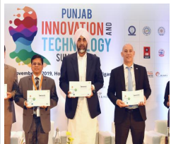
ਪੰਜਾਬ ਦੇ ਵਿੱਤ ਮੰਤਰੀ ਮਨਪ੍ਰੀਤ ਸਿੰਘ ਬਾਦਲ ਲਲਿਤ ਹੋਟਲ ਚੰਡੀਗੜ੍ਹ ਵਿਖੇ 'ਪੰਜਾਬ ਇਨੋਵੇਸ਼ਨ ਅਤੇ ਤਕਨਾਲੋਜੀ ਸਮਿੱਟ 2019' ਦੌਰਾਨ