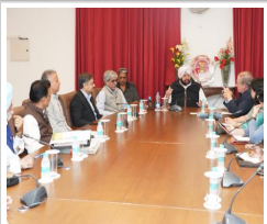
CAPT AMARINDER SEEKS WB SUPPORT TO HELP PUNJAB'S FARMERS SHIFT TO ALTERNATE CROPS TO BOOST INCOME & SAVE WATER