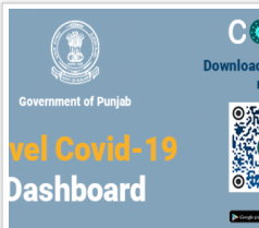
Corona Mobile APP