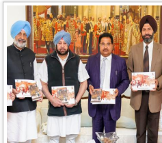
Punjab Chief Minister Captain Amarinder Singh Released A Booklet 'Because We Haven't Forgotten...' Along With A CD Of Documentary Film 'Jallianwala Bagh Punjab Da Dil' In Punjabi And Hindi Dedicated To Jallianwala Bagh Centenary Commemoration