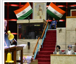
Punjab Chief Minister Captain Amarinder Singh During Fourth Day Of Budget Session Of Punjab Vidhan Sabha On Wednesday.