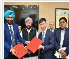
PUNJAB INKS MoU WITH SINGAPORE'S CIG TO EXPLORE LEADERSHIP TRAINING, SHOWCASE STATE AS INVESTMENT DESTINATION