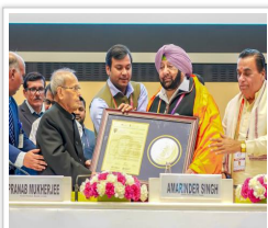
CAPT AMARINDER CONFERRED WITH 10th BCS 'IDEAL CHIEF MINISTER' AWARD FOR UNIQUE INITIATIVES TO BOOST STATE'S HOLISTIC GROWTH