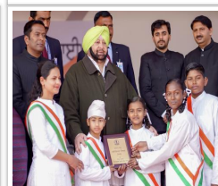
Punjab Chief Minister Captain Amarinder Singh Presenting A Memento To A Group Of Specially-Abled Children Which Performed National Anthem During 71st Republic Day