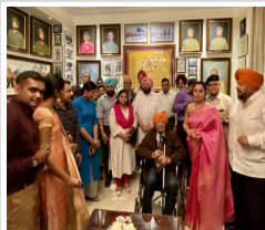
A ROOM SEEPED IN VALOUR – CAPT AMARINDER'S ODE TO 2 SIKHS