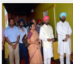
CABINET MINISTER CHARANJIT SINGH CHANNI AND BALBIR SINGH SIDHU LAUNCHED 4-MONTH ELABORATE PROGRAMME TO COMMEMORATE GURU SAHIB'S MEMORY