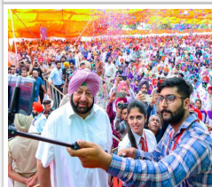
Ghar Ghar Rozgar & Karobar Mission' Scheme, Punjab Chief Minister On Saturday Declared All-Out Efforts To Identify The Poorest Of The Poor Jobless In Villages For Employment, Even As He Announced A Free Coaching Scheme For Candidates To Prepare For Group