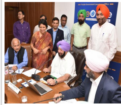
PUNJAB GOES TOTALLY HI-TECH AS CAPT AMARINDER LAUNCHES EOFFICE FOR ELECTRONIC FILE MOVEMENT