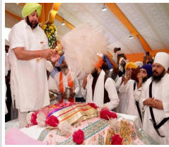
CAPT AMARINDER USHERS IN WEEK-LONG 550TH PRAKASH PURB CELEBRATIONS AT SULTANPUR LODHI WITH GURU GRANTH SAHIB SAROOP SEWA