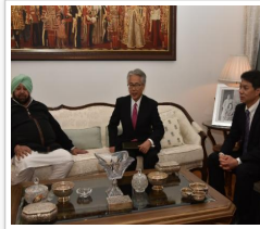
JAPANESE AMBASSADOR MEETS CAPT. AMARINDER, DISCUSSES INVESTMENT OPPORTUNITIES IN PUNJAB