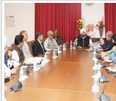
CAPT AMARINDER SEEKS WB SUPPORT TO HELP PUNJAB'S FARMERS SHIFT TO ALTERNATE CROPS TO BOOST INCOME & SAVE WATER