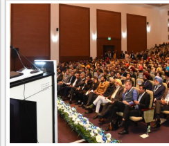
PUNJAB GOVT COMMITTED TO TRANSFORMING MSMEs INTO INDUSTRIAL GIANTS: VINI MAHAJAN