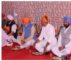
PM ALONG WITH CAPTAIN AMARINDER PARTAKES LANGAR IN PUNJAB GOVERNMENT PANDAL