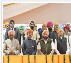
The President Of India Ram Nath Kovind, Governor Punjab VP Singh Badnore And Punjab Chief Minister Captain Amarinder Singh, Rajasthan Chief Minister Ashok Gehlot, Patiala Member Parliament Preet Kaur, Cultural Affairs Minister Charanjit Singh Channi