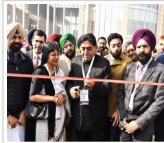
PPIS 2019 KICKS OFF WITH EXHIBITION SHOWCASING PRODUCTS OF TOP INDUSTRIES, MSMEs & STARTUPS