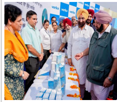
CAPTAIN AMARINDER SINGH LAUNCHES VERKA'S P.I.O NATURAL VANILA MILK & CHEALTD MINERAL MIXTURE