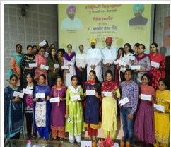
Balbir Singh Sidhu Gives Appointment Letters To 519 Community Health Officers