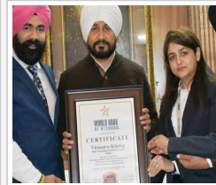
VIRASAT-E-KHALSA BAGS ANOTHER AWARD, GETS LISTED IN 'WORLD BOOK OF RECORDS'