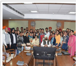
Health Minister S. Balbir Singh Sidhu Hands Over Appointment Letters To 74 Medical Lab Technicians