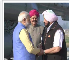
Prime Minister Mr. Narendra Modi Being Received By Punjab Governor Mr. VP Singh Badnore And Chief Minister Captain Amarinder Singh At Bussowal Village In Sultanpur Lodhi On Saturday.