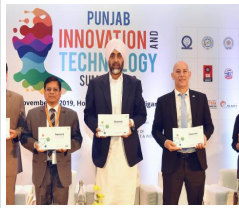
ਪੰਜਾਬ ਦੇ ਵਿੱਤ ਮੰਤਰੀ ਮਨਪ੍ਰੀਤ ਸਿੰਘ ਬਾਦਲ ਲਾਲਿਤ ਹੋਟਲ ਚੰਡੀਗੜ੍ਹ ਵਿਖੇ 'ਪੰਜਾਬ ਇਨੋਵੇਸ਼ਨ ਅਤੇ ਤਕਨਾਲੋਜੀ ਸਮਿੱਟ 2019' ਦੌਰਾਨ