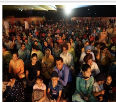
MORE THAN 8800 VISITORS VISIT LIGHT & SOUND SHOW ALONG WITH DIGITAL MUSEUM IN LUDHIANA