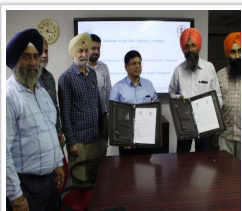
PUNJAB INKS MoU WITH INDUSTRIAL ASSOCIATIONS & GNDEC-LUDHIANA TO PROMOTE RESEARCH & INNOVATION