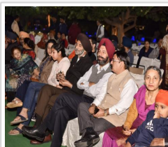
STUPENDOUS FLOATING MULTIMEDIA LIGHT AND SOUND SHOW DRAWS UNPRECEDENTED RUSH OF PEOPLE