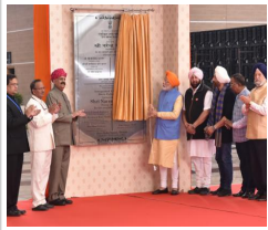
Prime Minister Narendra Modi Along With Punjab Governor VP Singh Badnore And Chief Minister Captain Amarinder Singh Inaugurating The Integrated Check Post At Dera Baba Nanak To Mark The Opening Of Kartarpur Corridor On Saturday.