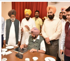
CAPT AMARINDER LAUNCHES 1ST OF ITS KIND 'PUNJAB JOB HELPLINE' FOR UNEMPLOYED YOUTH