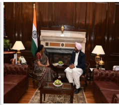
MANPREET BADAL SEEKS EARLY RELEASE OF GST ARREARS FROM NIRMALA SITHARAMAN