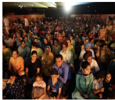
MORE THAN 8800 VISITORS VISIT LIGHT & SOUND SHOW ALONG WITH DIGITAL MUSEUM IN LUDHIANA