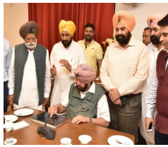
CAPT AMARINDER LAUNCHES 1ST OF ITS KIND 'PUNJAB JOB HELPLINE' FOR UNEMPLOYED YOUTH