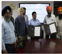
PUNJAB INKS MoU WITH INDUSTRIAL ASSOCIATIONS & GNDECLUDHIANA TO PROMOTE RESEARCH & INNOVATION