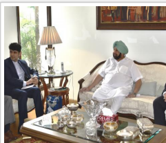
CAPT AMARINDER MOOTS A PUNJAB IRAN CHAMBER OF COMMERCE TO BOOST TRADE, INVITES IRANIAN ENVOY TO 550TH PRAKASH PURB