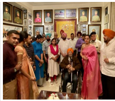
A ROOM SEEPED IN VALOUR – CAPT AMARINDER'S ODE TO 2 SIKHS