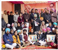
AT PUNJAB CONGRESS PROTEST DHARNA, CM DECLARES `WE WILL NOT TOLERATE ANY ATTEMPT TO TINKER WITH CONSTITUTION'S PREAMBLE'