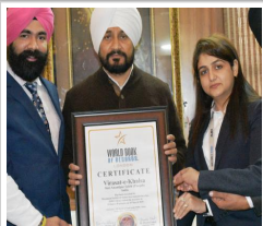
VIRASAT-E-KHALSA BAGS ANOTHER AWARD, GETS LISTED IN 'WORLD BOOK OF RECORDS'