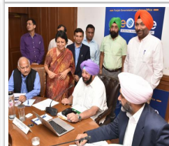
PUNJAB GOES TOTALLY HI-TECH AS CAPT AMARINDER LAUNCHES OFFICE FOR ELECTRONIC FILE MOVEMENT