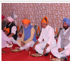
PM ALONG WITH CAPTAIN AMARINDER PARTAKES LANGAR IN PUNJAB GOVERNMENT PANDAL