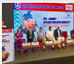
DELEGATION OF PUNJAB GOVERNMENT HOLDS PRE-SUMMIT INTERACTION WITH INDUSTRY