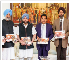
Punjab Chief Minister Captain Amarinder Singh Released A Booklet 'Because We Haven't Forgotten...' Along With A CD Of Documentary Film 'Jallianwala Bagh Punjab Da Dil' In Punjabi And Hindi Dedicated To Jallianwala Bagh Centenary Commemoration