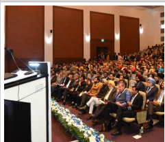
PUNJAB GOVT COMMITTED TO TRANSFORMING MSMEs INTO INDUSTRIAL GIANTS: VINI MAHAJAN