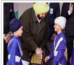
Punjab Chief Minister Captain Amarinder Singh Presenting A Memento To The Budding Gatka Players On 71st Republic Day Function At SAS Nagar (Mohali) On Sunday.