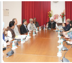
CAPT AMARINDER SEEKS WB SUPPORT TO HELP PUNJAB'S FARMERS SHIFT TO ALTERNATE CROPS TO BOOST INCOME & SAVE WATER