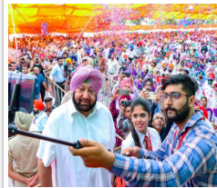
Ghar Ghar Rozgar & Karobar Mission' Scheme, Punjab Chief Minister On Saturday Declared All-Out Efforts To Identify The Poorest Of The Poor Jobless In Villages For Employment, Even As He Announced A Free Coaching Scheme For Candidates To Prepare For Group