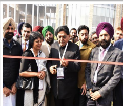
PPIS 2019 KICKS OFF WITH EXHIBITION SHOWCASING PRODUCTS OF TOP INDUSTRIES, MSMEs & STARTUPS