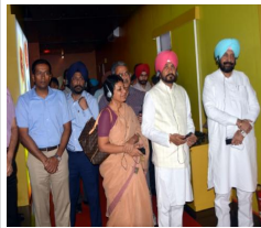
CABINET MINISTER CHARANJIT SINGH CHANNI AND BALBIR SINGH SIDHU LAUNCHED 4-MONTH ELABORATE PROGRAMME TO COMMEMORATE GURU SAHIB'S MEMORY