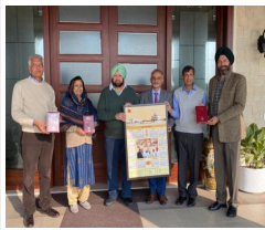
Punjab Chief Minister Captain Amarinder Singh On Saturday Released The Punjab Government's Diary And Calendar For The Year 2020. The New Year Calendar Is Dedicated To The Khulle Darshan-Didar Of Sri Darbar Sahib In Kartarpur, Pakistan.