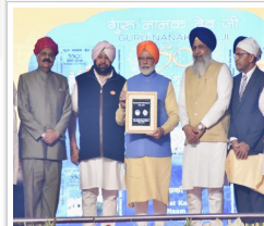
CAPT AMARINDER SINGH HOPES CORRIDOR WOULD LEAD TO PEACEFUL ENVIRONMENT BETWEEN BOTH COUNTRIES LEADING TO EASY ACCESS TO OTHER GURDWARAS