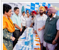
CAPTAIN AMARINDER SINGH LAUNCHES VERKA'S PIO NATURAL VANILA MILK & CHEALTED MINERAL MIXTURE