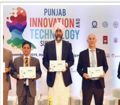
ਪੰਜਾਬ ਦੇ ਵਿੱਤ ਮੰਤਰੀ ਮਨਪ੍ਰੀਤ ਸਿੰਘ ਬਾਦਲ ਲਾਇਤ ਹੋਟਲ ਚੰਡੀਗੜ੍ਹ ਵਿਖੇ 'ਪੰਜਾਬ ਇਨੋਵੇਸ਼ਨ ਅਤੇ ਤਕਨਾਲੋਜੀ ਸਮਿੱਟ 2019' ਦੌਰਾਨ