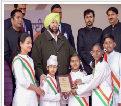
Punjab Chief Minister Captain Amarinder Singh Presenting A Memento To A Group Of Specially-Abled Children Which Performed National Anthem During 71st Republic Day Function At SAS Nagar (Mohali) On Sunday.