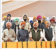
The President Of India Ram Nath Kovind, Governor Punjab VP Singh Badnore And Punjab Chief Minister Captain Amarinder Singh, Rajasthan Chief Minister Ashok Gehlot, Patiala Member Parliament Preet Kaur, Cultural Affairs Minister Charanjit Singh Channi