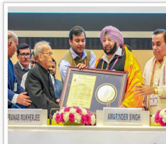
CAPT AMARINDER CONFERRED WITH 10th BCS 'IDEAL CHIEF MINISTER' AWARD FOR UNIQUE INITIATIVES TO BOOST STATE'S HOLISTIC GROWTH