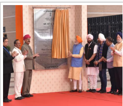
Prime Minister Narendra Modi Along With Punjab Governor VP Singh Badnore And Chief Minister Captain Amarinder Singh Inaugurating The Integrated Check Post At Dera Baba Nanak To Mark The Opening Of Kartarpur Corridor On Saturday.