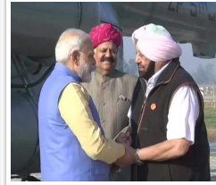
Prime Minister Mr. Narendra Modi Being Received By Punjab Governor Mr. VP Singh Badnore And Chief Minister Captain Amarinder Singh At Bussowal Village In Sultanpur Lodhi On Saturday.

HIGH COMMISSIONER OF INDIA TO UK RUCHI GHANASHYAM PRESENTING A HAND PAINTED PHOTOGRAPH OF SRI KARTARPUR SAHIB GURDWARA TO PUNJAB CHIEF MINISTER CAPTAIN AMARINDER SINGH DURING A SPECIAL FUNCTION ORGANIZED BY INDIAN DIASPORA TO MARK 550TH BIRTH ANNIVERSARY