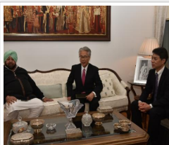
JAPANESE AMBASSADOR MEETS CAPT. AMARINDER, DISCUSSES INVESTMENT OPPORTUNITIES IN PUNJAB