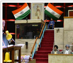
Punjab Chief Minister Captain Amarinder Singh During Fourth Day Of Budget Session Of Punjab Vidhan Sabha On Wednesday.