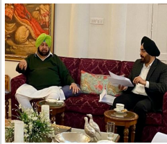
CAPT AMARINDER MEETS NHAI CHAIRMAN, BOTH AGREE ON EXPEDITIOUS COMMENCEMENT OF WORK ON DELHI-AMRITSAR-KATRA EXPRESSWAY PROJECT