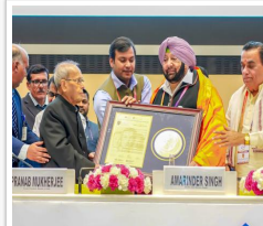
CAPT AMARINDER CONFERRED WITH 10th BCS 'IDEAL CHIEF MINISTER' AWARD FOR UNIQUE INITIATIVES TO BOOST STATE'S HOLISTIC GROWTH