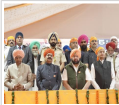
The President Of India Ram Nath Kovind, Governor Punjab VP Singh Badnore And Punjab Chief Minister Captain Amarinder Singh, Rajasthan Chief Minister Ashok Gehlot, Patiala Member Parliament Preet Kaur, Cultural Affairs Minister Charanjit Singh Channi