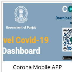
Corona Mobile APP