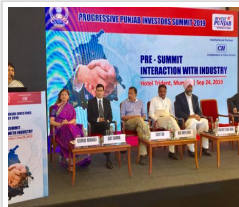
DELEGATION OF PUNJAB GOVERNMENT HOLDS PRE-SUMMIT INTERACTION WITH INDUSTRY