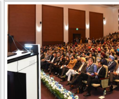
PUNJAB GOVT COMMITTED TO TRANSFORMING MSMEs INTO INDUSTRIAL GIANTS: VINI MAHAJAN