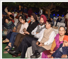
STUPENDOUS FLOATING MULTIMEDIA LIGHT AND SOUND SHOW DRAWS UNPRECEDENTED RUSH OF PEOPLE