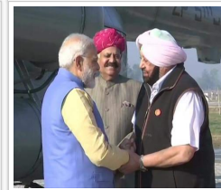
Prime Minister Mr. Narendra Modi Being Received By Punjab Governor Mr. VP Singh Badnore And Chief Minister Captain Amarinder Singh At Bussawal Village In Sultanpur Lodhi On Saturday.