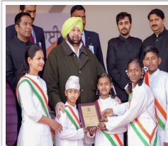
Punjab Chief Minister Captain Amarinder Singh Presenting A Memento To A Group Of Specially-Abled Children Which Performed National Anthem During 71st Republic Day