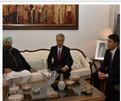
JAPANESE AMBASSADOR MEETS CAPT. AMARINDER, DISCUSSES INVESTMENT OPPORTUNITIES IN PUNJAB