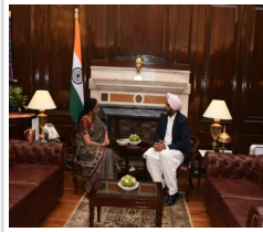
MANPREET BADAL SEEKS EARLY RELEASE OF GST ARREARS FROM NIRMALA SITHARAMAN