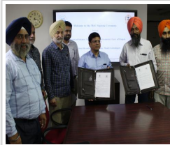
PUNJAB INKS MoU WITH INDUSTRIAL ASSOCIATIONS & GNDECLUDHIANA TO PROMOTE RESEARCH & INNOVATION