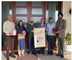
Punjab Chief Minister Captain Amarinder Singh On Saturday Released The Punjab Government's Diary And Calendar For The Year 2020. The New Year Calendar Is Dedicated To The Khulle Darshan-Didar Of Sri Darbar Sahib In Kartarpur, Pakistan.