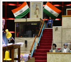
Punjab Chief Minister Captain Amarinder Singh During Fourth Day Of Budget Session Of Punjab Vidhan Sabha On Wednesday.