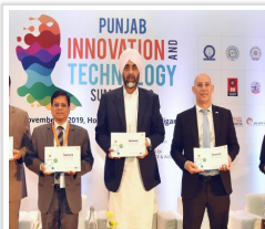
ਪੰਜਾਬ ਦੇ ਵਿੱਤ ਮੰਤਰੀ ਮਨਪ੍ਰੀਤ ਸਿੰਘ ਬਾਦਲ ਲਲਿਤ ਹੋਟਲ ਚੰਡੀਗੜ੍ਹ ਵਿਖੇ 'ਪੰਜਾਬ ਇਨੋਵੇਸ਼ਨ ਅਤੇ ਤਕਨਾਲੋਜੀ ਸਮਿੱਟ 2019' ਦੌਰਾਨ