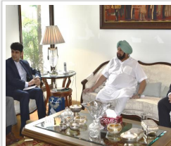
CAPT AMARINDER MOOTS A PUNJAB IRAN CHAMBER OF COMMERCE TO BOOST TRADE, INVITES IRANIAN ENVOY TO 550TH PRAKASH PURB