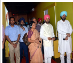
CABINET MINISTER CHARANJIT SINGH CHANNI AND BALBIR SINGH SIDHU LAUNCHED 4-MONTH ELABORATE PROGRAMME TO COMMEMORATE GURU SAHIB'S MEMORY