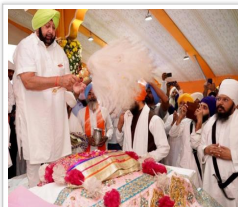
CAPT AMARINDER USHERS IN WEEK-LONG 550TH PRAKASH PURB CELEBRATIONS AT SULTANPUR LODHI WITH GURU GRANTH SAHIB SAROOP SEWA