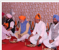
PM ALONG WITH CAPTAIN AMARINDER PARTAKES LANGAR IN PUNJAB GOVERNMENT PANDAL