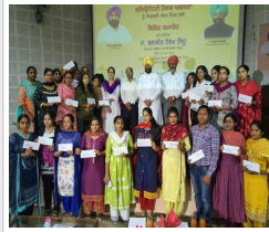
Balbir Singh Sidhu Gives Appointment Letters To 519 Community Health Officers