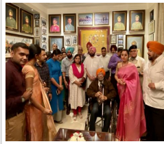
A ROOM SEEPED IN VALOUR – CAPT AMARINDER'S ODE TO 2 SIKHS