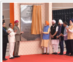
Prime Minister Narendra Modi Along With Punjab Governor VP Singh Badnore And Chief Minister Captain Amarinder Singh Inaugurating The Integrated Check Post At Dera Baba Nanak To Mark The Opening Of Kartarpur Corridor On Saturday.