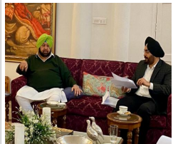
CAPT AMARINDER MEETS NHAI CHAIRMAN, BOTH AGREE ON EXPEDITIOUS COMMENCEMENT OF WORK ON DELHI-AMRITSAR-KATRA EXPRESSWAY PROJECT