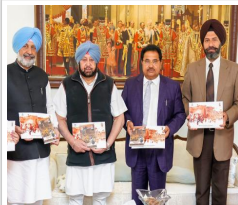
Punjab Chief Minister Captain Amarinder Singh Released A Booklet 'Because We Haven't Forgotten...' Along With A CD Of Documentary Film 'Jallianwala Bagh Punjab Da Dil' In Punjabi And Hindi Dedicated To Jallianwala Bagh Centenary Commemoration