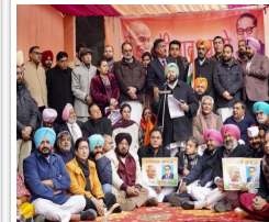
AT PUNJAB CONGRESS PROTEST DHARNA, CM DECLARES 'WE WILL NOT TOLERATE ANY ATTEMPT TO TINKER WITH CONSTITUTION'S PREAMBLE'