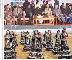
Punjab Chief Minister Captain Amarinder Singh Along With Dignitaries Witnessing The Cultural Programme On 71st Republic Day Function At SAS Nagar (Mohali) On Sunday.