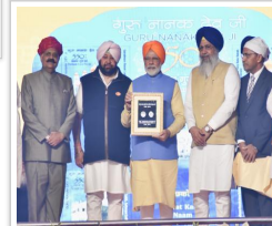
CAPT AMARINDER SINGH HOPES CORRIDOR WOULD LEAD TO PEACEFUL ENVIRONMENT BETWEEN BOTH COUNTRIES LEADING TO EASY ACCESS TO OTHER GURDWARAS