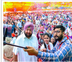
Ghar Ghar Rozgar & Karobar Mission' Scheme, Punjab Chief Minister On Saturday Declared All-Out Efforts To Identify The Poorest Of The Poor Jobless In Villages For Employment, Even As He Announced A Free Coaching Scheme For Candidates To Prepare For Group