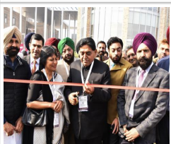
PPIS 2019 KICKS OFF WITH EXHIBITION SHOWCASING PRODUCTS OF TOP INDUSTRIES, MSMEs & STARTUPS