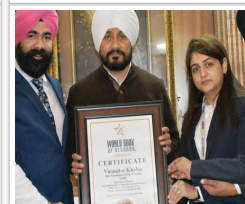
VIRASAT-E-KHALSA BAGS ANOTHER AWARD, GETS LISTED IN 'WORLD BOOK OF RECORDS'