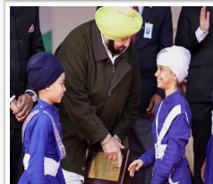
Punjab Chief Minister Captain Amarinder Singh Presenting A Memento To The Budding Gatka Players On 71st Republic Day Function At SAS Nagar (Mohali) On Sunday.