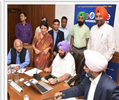
PUNJAB GOES TOTALLY HI-TECH AS CAPT AMARINDER LAUNCHES EOFFICE FOR ELECTRONIC FILE MOVEMENT