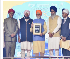
CAPT AMARINDER SINGH HOPES CORRIDOR WOULD LEAD TO PEACEFUL ENVIRONMENT BETWEEN BOTH COUNTRIES LEADING TO EASY ACCESS TO OTHER GURDWARAS