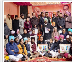
AT PUNJAB CONGRESS PROTEST DHARNA, CM