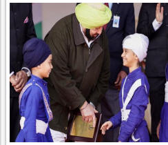
Punjab Chief Minister Captain Amarinder Singh Presenting A Memento To The Budding Gatka Players On 71st Republic Day Function At SAS Nagar (Mohali) On Sunday.