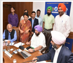
PUNJAB GOES TOTALLY HI-TECH AS CAPT AMARINDER LAUNCHES EOFFICE FOR ELECTRONIC FILE MOVEMENT