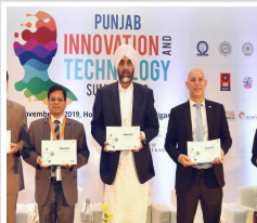
ਪੰਜਾਬ ਦੇ ਵਿੱਤ ਮੰਤਰੀ ਮਨਜੀਤ ਸਿੰਘ ਬਾਦਲ ਲਾਲਿਤ ਹੋਟਲ ਚੰਡੀਗੜ੍ਹ ਵਿਖੇ 'ਪੰਜਾਬ ਇਨੋਵੇਸ਼ਨ ਅਤੇ ਤਕਨਾਲੋਜੀ ਸਮਿੱਟ 2019' ਦੌਰਾਨ