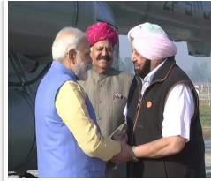
Prime Minister Mr. Narendra Modi Being Received By Punjab Governor Mr. VP Singh Badnore And Chief Minister Captain Amarinder Singh At Bussawal Village In Sultanpur Lodhi On Saturday.