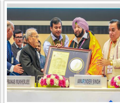
CAPT AMARINDER CONFERRED WITH 10th BCS 'IDEAL CHIEF MINISTER' AWARD FOR UNIQUE INITIATIVES TO BOOST STATE'S HOLISTIC GROWTH