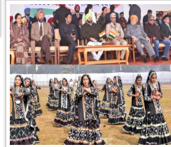
Punjab Chief Minister Captain Amarinder Singh Along With Dignitaries Witnessing The Cultural Programme On 71st Republic Day Function At SAS Nagar (Mohali) On Sunday.