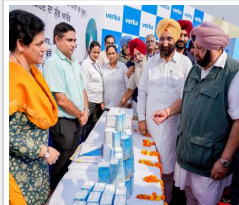
CAPTAIN AMARINDER SINGH LAUNCHES VERKA'S PIO NATURAL VANILA MILK & CHELATED MINERAL MIXTURE