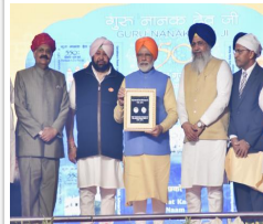
CAPT AMARINDER SINGH HOPES CORRIDOR WOULD LEAD TO PEACEFUL ENVIRONMENT BETWEEN BOTH COUNTRIES LEADING TO EASY ACCESS TO OTHER GURDWARAS