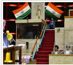
Punjab Chief Minister Captain Amarinder Singh During Fourth Day Of Budget Session Of Punjab Vidhan Sabha On Wednesday.