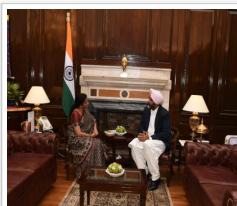
MANPREET BADAL SEEKS EARLY RELEASE OF GST ARREARS FROM NIRMALA SITHARAMAN