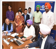
PUNJAB GOES TOTALLY HI-TECH AS CAPT AMARINDER LAUNCHES OFFICE FOR ELECTRONIC FILE MOVEMENT