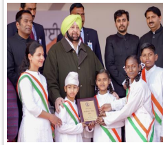
Punjab Chief Minister Captain Amarinder Singh Presenting A Memento To A Group Of Specially-Abled Children Which Performed National Anthem During 71st Republic Day Function At SAS Nagar (Mohali) On Sunday.