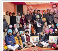
AT PUNJAB CONGRESS PROTEST DHARNA, CM