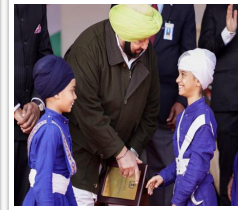
Punjab Chief Minister Captain Amarinder Singh Presenting A Memento To The Budding Gatka Players On 71st Republic Day Function At SAS Nagar (Mohali) On Sunday.