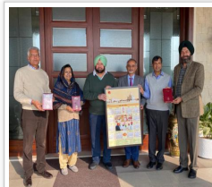
Punjab Chief Minister Captain Amarinder Singh