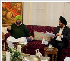
CAPT AMARINDER MEETS NHAI CHAIRMAN, BOTH