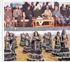
Punjab Chief Minister Captain Amarinder Singh Along With Dignitaries Witnessing The Cultural Programme On 71st Republic Day Function At SAS Nagar (Mohali) On Sunday.