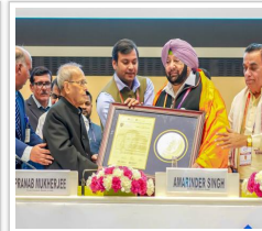
CAPT AMARINDER CONFERRED WITH 10th BCS 'IDEAL CHIEF MINISTER' AWARD FOR UNIQUE INITIATIVES TO BOOST STATE'S HOLISTIC GROWTH