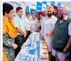
CAPTAIN AMARINDER SINGH LAUNCHES VERKA'S PIO NATURAL VANILA MILK & CHEALTED MINERAL MIXTURE