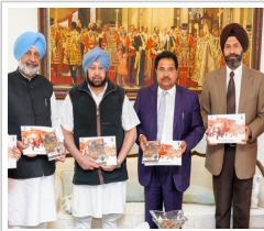
Punjab Chief Minister Captain Amarinder Singh Released A Booklet 'Because We Haven't Forgotten...' Along With A CD Of Documentary Film 'Jallianwala Bagh Punjab Da Dil' In Punjabi And Hindi Dedicated To Jallianwala Bagh Centenary Commemoration