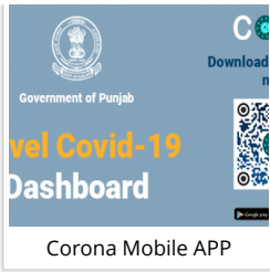
Corona Mobile APP