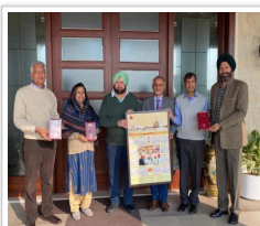
Punjab Chief Minister Captain Amarinder Singh On Saturday Released The Punjab Government's Diary And Calendar For The Year 2020. The New Year Calendar Is Dedicated To The Khulle Darshan-Didar Of Sri Darbar Sahib In Kartarpur, Pakistan.