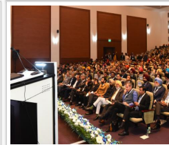
PUNJAB GOVT COMMITTED TO TRANSFORMING MSMEs INTO INDUSTRIAL GIANTS: VINI MAHAJAN