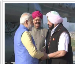
Prime Minister Mr. Narendra Modi Being