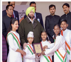
Punjab Chief Minister Captain Amarinder Singh Presenting A Memento To A Group Of Specially-Abled Children Which Performed National Anthem During 71st Republic Day Function At SAS Nagar (Mohali) On Sunday.