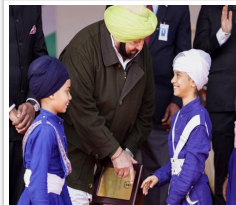
Punjab Chief Minister Captain Amarinder Singh Presenting A Memento To The Budding GATKA Players On 71st Republic Day Function At SAS Nagar (Mohali) On Sunday.