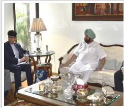
CAPT AMARINDER MOOTS A PUNJAB IRAN CHAMBER OF COMMERCE TO BOOST TRADE, INVITES IRANIAN ENVOY TO 550TH PRAKASH PURB

Jobless In Villages For Employment, Even As He Announced A Free Coaching Scheme For Candidates To Prepare For Group