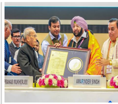
CAPT AMARINDER CONFERRED WITH 10th BCS 'IDEAL CHIEF MINISTER' AWARD FOR UNIQUE INITIATIVES TO BOOST STATE'S HOLISTIC GROWTH