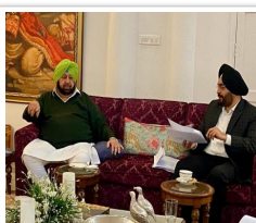
CAPT AMARINDER MEETS NHAI CHAIRMAN, BOTH AGREE ON EXPEDITIOUS COMMENCEMENT OF WORK ON DELHI-AMRITSAR-KATRA EXPRESSWAY PROJECT