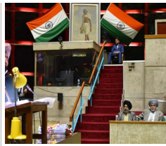
Punjab Chief Minister Captain Amarinder Singh During Fourth Day Of Budget Session Of Punjab Vidhan Sabha On Wednesday.