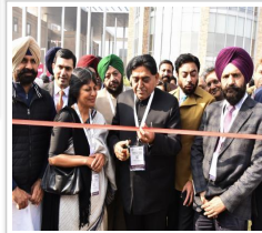
PPIS 2019 KICKS OFF WITH EXHIBITION SHOWCASING PRODUCTS OF TOP INDUSTRIES, MSMEs & STARTUPS