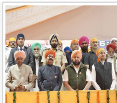
The President Of India Ram Nath Kovind,