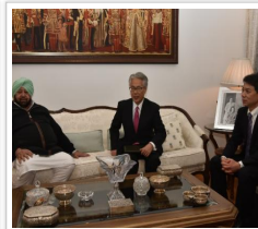
JAPANESE AMBASSADOR MEETS CAPT. AMARINDER, DISCUSSES INVESTMENT OPPORTUNITIES IN PUNJAB