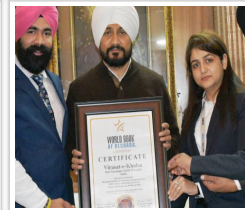
VIRASAT-E-KHALSA BAGS ANOTHER AWARD, GETS LISTED IN 'WORLD BOOK OF RECORDS'