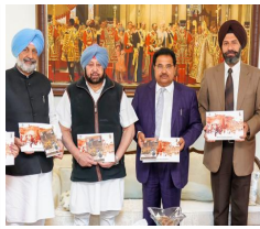
Punjab Chief Minister Captain Amarinder Singh Released A Booklet 'Because We Haven't Forgotten...' Along With A CD Of Documentary Film 'Jallianwala Bagh Punjab Da Dil' In Punjabi And Hindi Dedicated To Jallianwala Bagh Centenary Commemoration