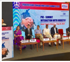
DELEGATION OF PUNJAB GOVERNMENT HOLDS PRE-SUMMIT INTERACTION WITH INDUSTRY