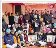
AT PUNJAB CONGRESS PROTEST DHARNA, CM DECLARES `WE WILL NOT TOLERATE ANY ATTEMPT TO TINKER WITH CONSTITUTION'S PREAMBLE'