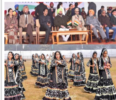
Punjab Chief Minister Captain Amarinder Singh Along With Dignitaries Witnessing The Cultural Programme On 71st Republic Day Function At SAS Nagar (Mohali) On Sunday.