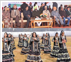
Punjab Chief Minister Captain Amarinder Singh Along With Dignitaries Witnessing The Cultural Programme On 71st Republic Day Function At SAS Nagar (Mohali) On Sunday.