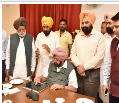
CAPT AMARINDER LAUNCHES 1ST OF ITS KIND 'PUNJAB JOB HELPLINE' FOR UNEMPLOYED YOUTH