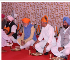
PM ALONG WITH CAPTAIN AMARINDER PARTAKES LANGAR IN PUNJAB GOVERNMENT PANDAL