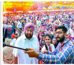
Ghar Ghar Rozgar & Karobar Mission' Scheme, Punjab Chief Minister On Saturday Declared All-Out Efforts To Identify The Poorest Of The Poor Jobless In Villages For Employment, Even As He Announced A Free Coaching Scheme For Candidates To Prepare For Group