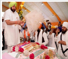
CAPT AMARINDER USHERS IN WEEK-LONG 550TH PRAKASH PURB CELEBRATIONS AT SULTANPUR LODHI WITH GURU GRANTH SAHIB SAROOP SEWA