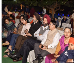
STUPENDOUS FLOATING MULTIMEDIA LIGHT AND SOUND SHOW DRAWS UNPRECEDENTED RUSH OF PEOPLE