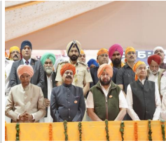
The President Of India Ram Nath Kovind, Governor Punjab VP Singh Badnore And Punjab Chief Minister Captain Amarinder Singh, Rajasthan Chief Minister Ashok Gehlot, Patiala Member Parliament Preet Kaur, Cultural Affairs Minister Charanjit Singh Channi