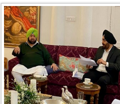
CAPT AMARINDER MEETS NHAI CHAIRMAN, BOTH AGREE ON EXPEDITIOUS COMMENCEMENT OF