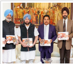
Punjab Chief Minister Captain Amarinder Singh Released A Booklet 'Because We Haven't Forgotten...' Along With A CD Of Documentary Film 'Jallianwala Bagh Punjab Da Dil' In Punjabi And Hindi Dedicated To Jallianwala Bagh Centenary Commemoration