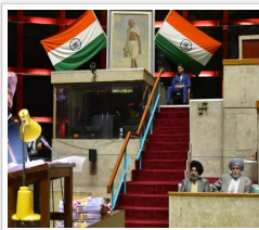
Punjab Chief Minister Captain Amarinder Singh During Fourth Day Of Budget Session Of Punjab Vidhan Sabha On Wednesday.