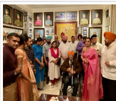
A ROOM SEEPED IN VALOUR - CAPT AMARINDER'S ODE TO 2 SIKHS