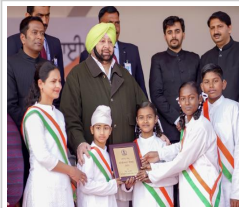
Punjab Chief Minister Captain Amarinder Singh Presenting A Memento To A Group Of Specially-Abled Children Which Performed National Anthem During 71st Republic Day Function At SAS Nagar (Mohali) On Sunday.