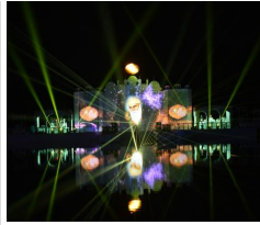
Floating Light And Sound Show At SUKHNA LAKE Chandigarh