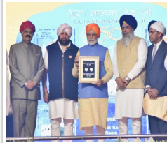
CAPT AMARINDER SINGH HOPES CORRIDOR WOULD LEAD TO PEACEFUL ENVIRONMENT BETWEEN BOTH COUNTRIES LEADING TO EASY ACCESS TO OTHER GURDWARAS