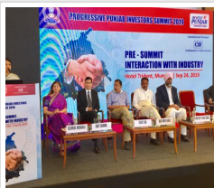
DELEGATION OF PUNJAB GOVERNMENT HOLDS PRE-SUMMIT INTERACTION WITH INDUSTRY