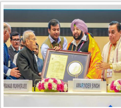
CAPT AMARINDER CONFERRED WITH 10th BCS 'IDEAL CHIEF MINISTER' AWARD FOR UNIQUE INITIATIVES TO BOOST STATE'S HOLISTIC GROWTH