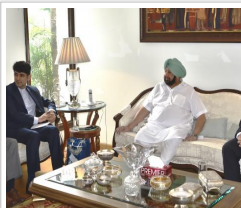
CAPT AMARINDER MOOTS A PUNJAB IRAN CHAMBER OF COMMERCE TO BOOST TRADE, INVITES IRANIAN ENVOY TO 550TH PRAKASH PURB