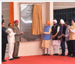
Prime Minister Narendra Modi Along With Punjab Governor VP Singh Badnore And Chief Minister Captain Amarinder Singh Inaugurating The Integrated Check Post At Dera Baba Nanak To Mark The Opening Of Kartarpur Corridor On Saturday.