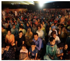
MORE THAN 8800 VISITORS VISIT LIGHT & SOUND SHOW ALONG WITH DIGITAL MUSEUM IN LUDHIANA