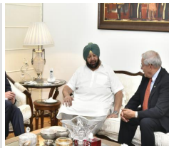
PUNJAB CM SEEKS INVESTMENT FROM US COMPANIES IN MEETING WITH NEW JERSEY SENATOR