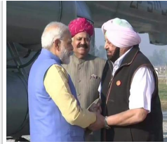
Prime Minister Mr. Narendra Modi Being Received By Punjab Governor Mr. VP Singh Badnore And Chief Minister Captain Amarinder Singh At Bussawal Village In Sultanpur Lodhi On Saturday.