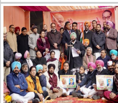
AT PUNJAB CONGRESS PROTEST DHARNA, CM DECLARES 'WE WILL NOT TOLERATE ANY ATTEMPT