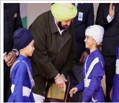
Punjab Chief Minister Captain Amarinder Singh Presenting A Memento To The Budding Gatka Players On 71st Republic Day Function At SAS Nagar (Mohali) On Sunday.