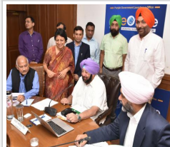
PUNJAB GOES TOTALLY HI-TECH AS CAPT AMARINDER LAUNCHES EOFFICE FOR ELECTRONIC FILE MOVEMENT