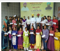
Balbir Singh Sidhu Gives Appointment Letters To 519 Community Health Officers