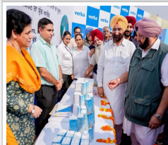
CAPTAIN AMARINDER SINGH LAUNCHES VERKA'S PIO NATURAL VANILA MILK & CHEALTED MINERAL MIXTURE