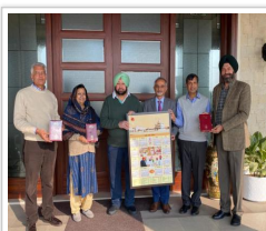
Punjab Chief Minister Captain Amarinder Singh On Saturday Released The Punjab Government's