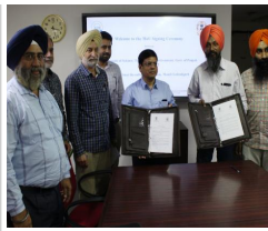
PUNJAB INKS MoU WITH INDUSTRIAL ASSOCIATIONS & GNDEC-LUDHIANA TO PROMOTE RESEARCH & INNOVATION