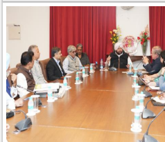
CAPT AMARINDER SEEKS WB SUPPORT TO HELP PUNJAB'S FARMERS SHIFT TO ALTERNATE CROPS TO BOOST INCOME & SAVE WATER